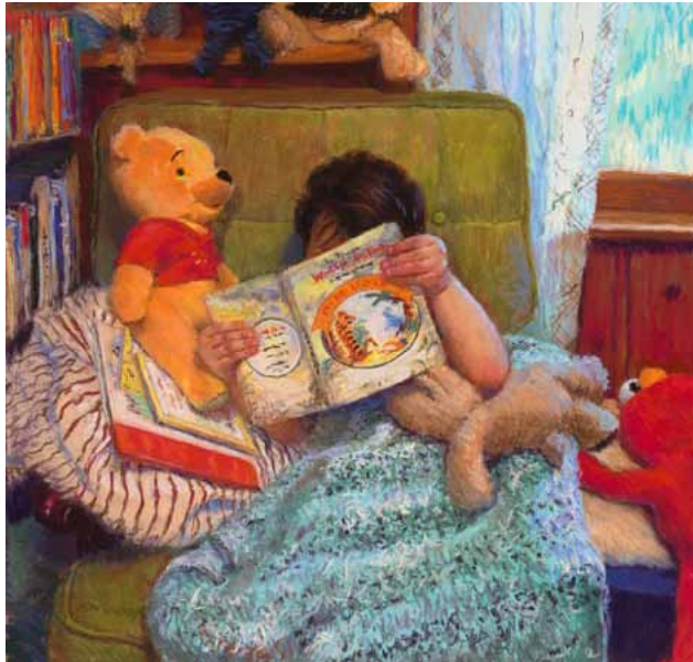
SUSAN KUZNITSKY: “ONCE UPON A TIME”

FIRST THURSDAY EVENING DEMO, JULY 7TH. DOORS OPEN WITH CRITIQUE AT 6 PM DEMO AT 7 PM